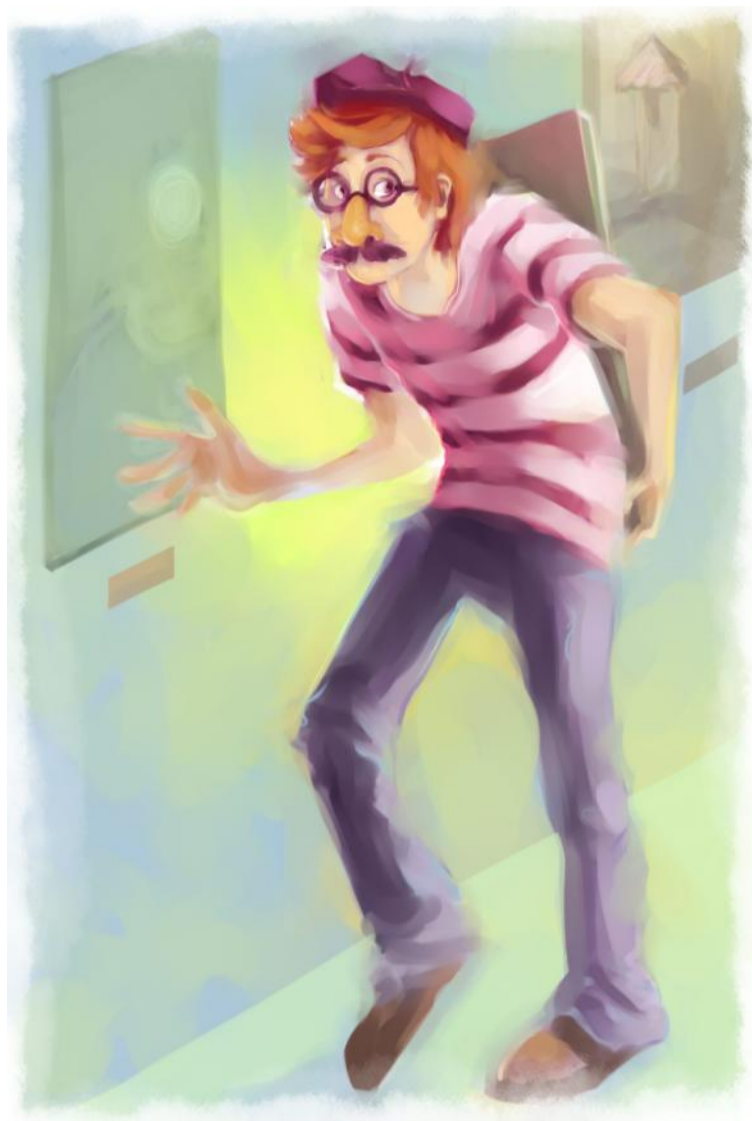
ILLUSTRATION BY KENZIE ZWAYER

I would recommend the Samsung Galaxy Tab 7.0 Plus for anyone who wants a full tablet experience without having to shell out the money for a new iPad.