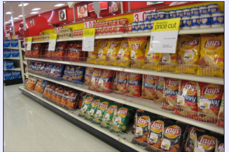
Super Bowl Sunday is this weekend! Have you stocked up on snack foods yet? The game begins at 5:30 p.m. The Super Bowl isn't always the biggest entertainment that day — sometimes the commercials are.

Due to the defensive decline of both teams and the ever-developing Giants offense, I predict the final score will be the same number of death threats Billy Cundiff gets in a day, 31-24, and Tom Brady will have his revenge in Indy.