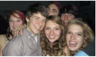
Homecoming Dance pix (are you in one?) . . . . . 2

I plan to live forever. So far, so good. —Steven Wright