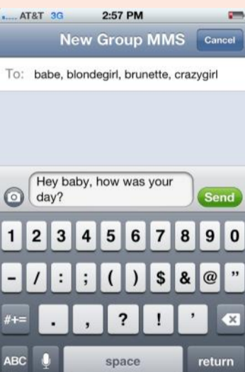
Ever get a message like this?