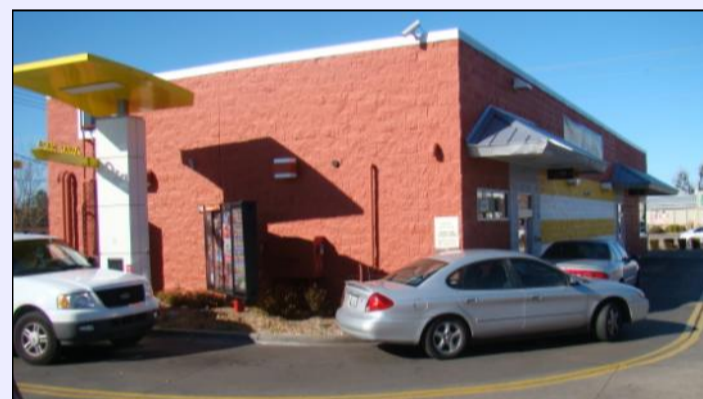
Want a job here? Try majoring in Agriculture.

Go Blue Republican. Vote for Ron Paul. Vote for America.