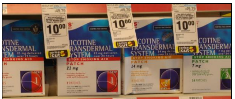
A clinical trial showed that the nicotine patch, available over the counter in drug stores, can improve memory in older adults.

Even so, doctors warn that patients should not administer nicotine except under a doctor's orders.