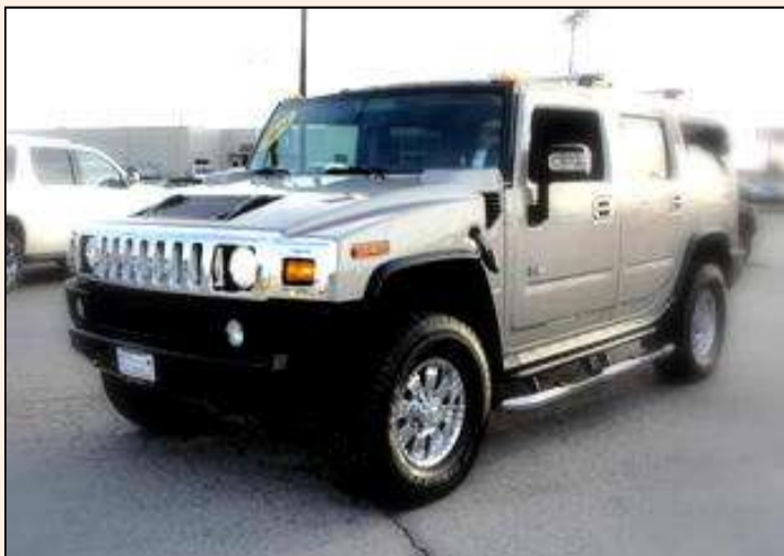
One of the few remaining Hummers for sale in Tulsa makes its last stand.