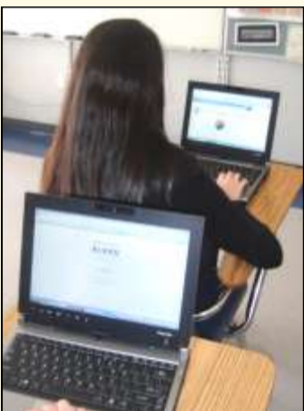
Meghan shows the pros of ALEKS.

In conclusion, instead of looking at the cons of ALEKS, look at more of the pros and consider how they are helping people succeed in mathematics rather than fail.