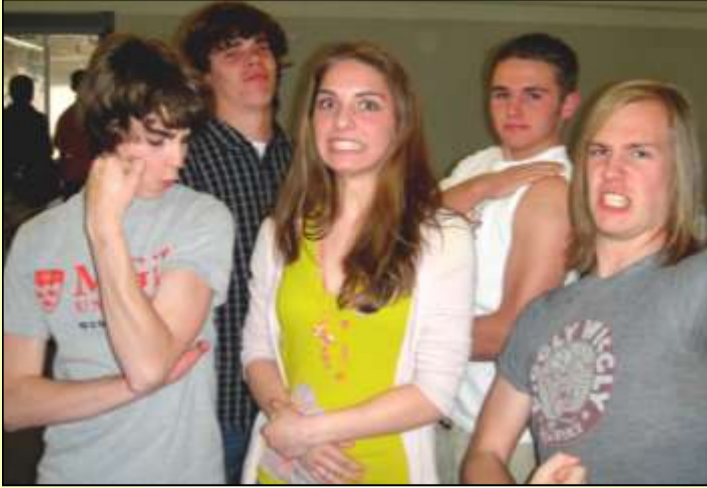
A girl could be overwhelmed by Riverfield's surplus of guys.