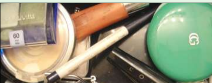
It's spring...time to clean up that makeup drawer!

If you follow these simple rules, everyone will love you! And by everyone, I mean the 5% of the high school that cares, of course.