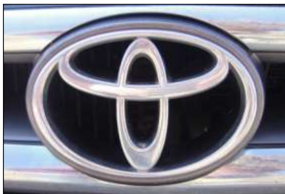
Admitting problems with unintended acceleration and failing brakes, Toyota has recalled thousands of cars from Camrys to Priuses.

Toyota is the top selling auto brand in the U.S. and has had a great track record up to this point, so the company has a chance. However, the company needs to regain the confidence of the consumer.