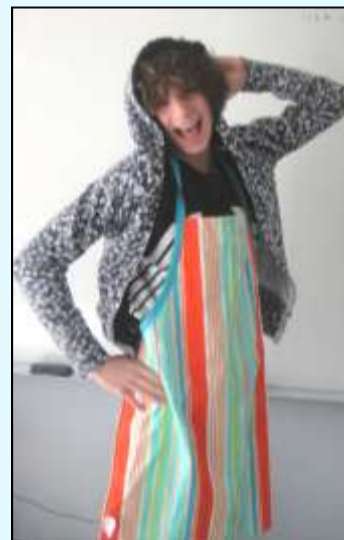
I'm sure this one will be a hit!

But wherever the trends end up taking us, there is no doubt they will highly influence our fashionable leanings this summer. And we all know we're looking forward to summer!