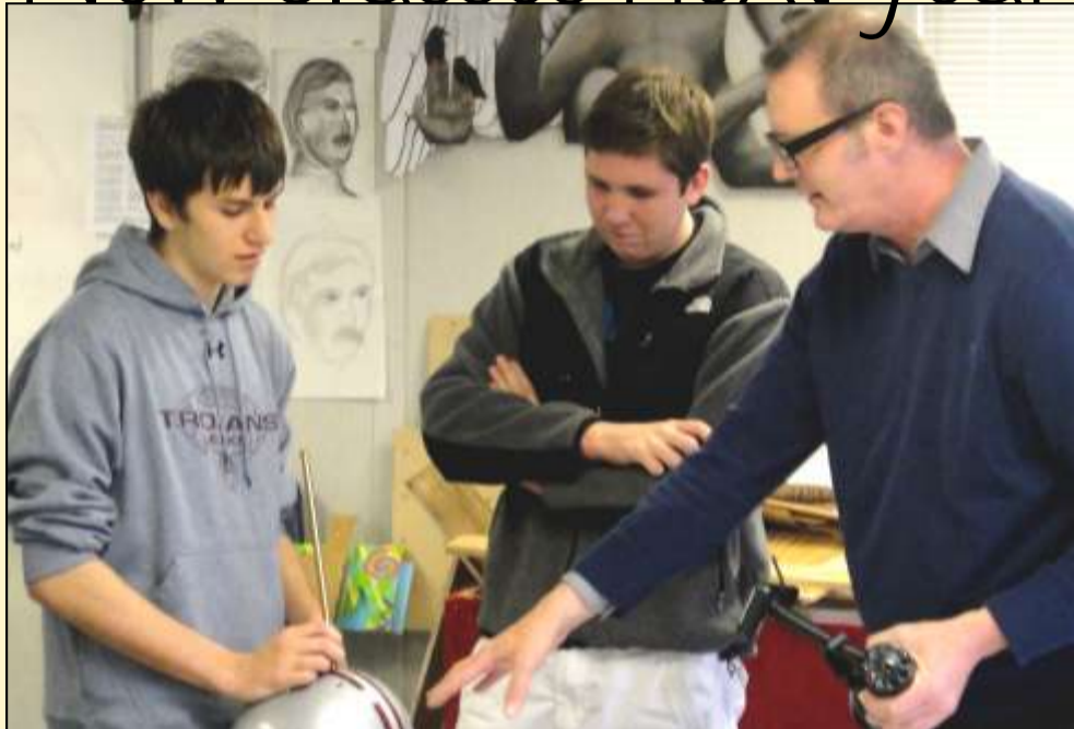
Mr. de Verges is looking forward to working with even more students next fall as the Upper School's arts curriculum expands.