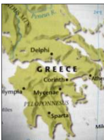
Greece goes belly-up in the vast Mediterranean sea.