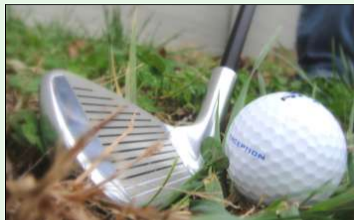
The world's best golfers will be teeing up next week for the annual Masters Tournament in Augusta, Georgia.

Despite all of these great contenders, I believe that a familiar figure will win this year's Masters. This is the year for Phil Mickelson to capture his fourth major title. The center of cheating accusations (for using a Ping wedge) this year, Mickelson more than ever is out to prove something. Now is the time for him to take the next step toward reaching Tiger.