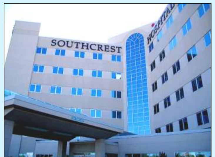
How will the new laws impact our area hospitals?

Letters to the Editor are welcome at any time, but all submissions considered for publication must be signed. E-mail to the Editor-in-Chief at mfaeth@riverfield.org .