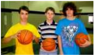
Three fans discuss their favorite NBA stars . . . . . 2

On the other hand, you have different fingers.