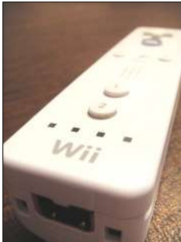
The controller that started it all.

Every company tries to save public face at one time or another, but Playstation isn't even trying to disguise it. They have completely ripped off the Wii's controller design.