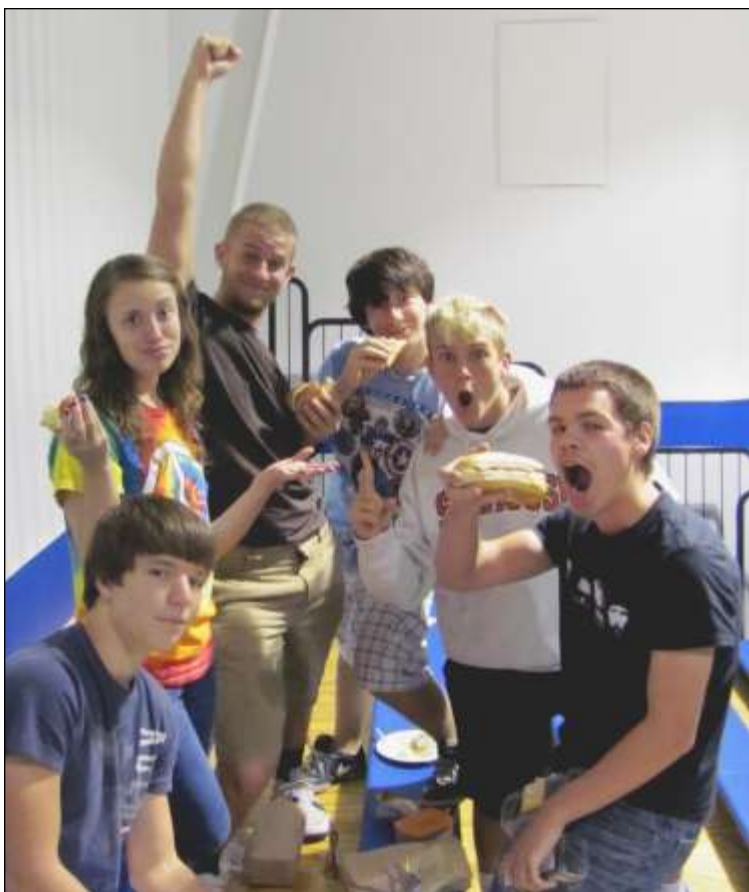
Corn dogs, funnel cakes, and corn on the cob, here we come!

If you plan to visit at night, carry your phone and wallet in your front pocket as a safety precaution. And most importantly, be sure to have a good time.