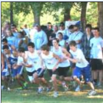
The Varsity boys compete at the Sapulpa meet.

Riverfield runners are preparing to take more trophies as they continue their daily practice runs. The statement, "pain is weakness leaving the body," can be heard across the Riverfield campus and hopefully across the finish lines of many races to come.