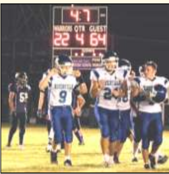
Raven players celebrated after their impressive win against Claremore Christian.

The Riverfield Ravens traveled to Claremore on September 3 to play the Claremore Christian Warriors. It was the first time in the Ravens' history to play on a true eight-man football field, which is 80 yards long instead of the more common 100 yards.