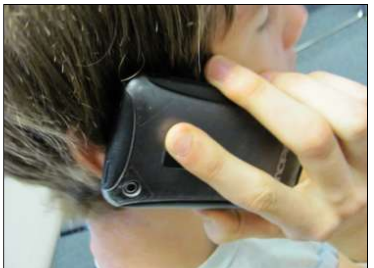
The city of San Francisco wants warnings about cell phone radiation posted wherever the phones are sold.

cisco's new cell phone safety law remains uncertain.