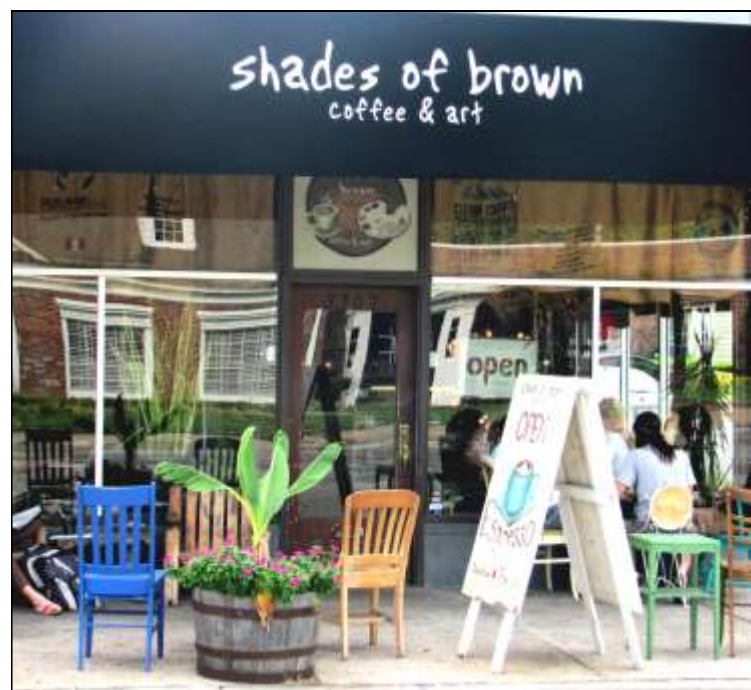
Brookside's Shades of Brown is one popular alternative.