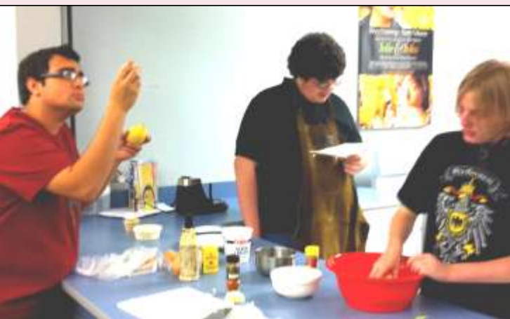
Knowing you’re going to eat what you cook makes you measure things more carefully.

After the crab cakes are done, top them with your choice of homemade chipotle sauce or tartar sauce. You can find either of these at Bodean Seafood Market near 51st and Harvard. Enjoy!