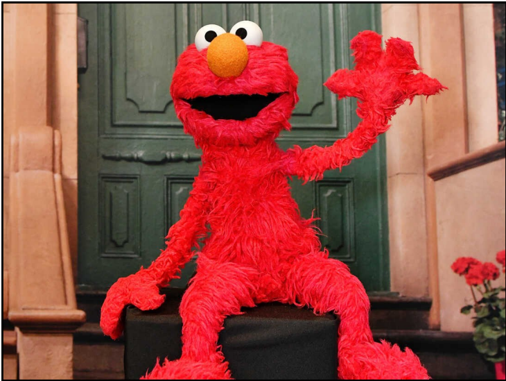
Elmo, the furry red monster, bit off more than he could chew when he asked folks on social media how they were doing.

to the ones he has, his responses have been spot-on with advice. But Elmo has gone on and exemplified what it means to be a caring person; from him, it is who we should learn from. Always remember that we can all learn from Elmo's example of empathy, acceptance, and authenticity. Even in this time, it's important to take the time to connect with others and offer support when needed. So strive to follow Elmo's advice and be a caring and compassionate company in the world.