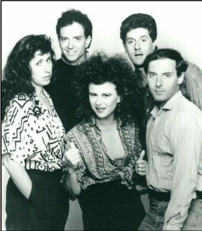
The original cast of the Tracey Ullman show in 1987.

When it came time to find other cast members aside from Ullman, that was pretty easy. Ullman had spotted a then relatively unknown Dan Castellaneta at The Second City comedy improv club in Chicago. Ullman asked him to read for the show and he agreed. Julie Kavner had previously worked with Brooks while playing the role of Brenda Morgensten, the hilarious "kid sister" of Valerie Harper's character, Rhoda, on the show Rhoda, which was a spin off of The Mary Tyler Moore Show. Kavner was at the top of the list of people Brooks wanted to be part of the show. Kavner accepted the offer to be part of the show. Other cast members included