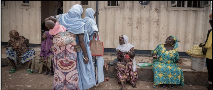
The makeshift health post in Durumi, Nigeria, struggles to keep up.

In Nigerian refugee camps, pregnant women are forced to deliver their children in harsh conditions. It is common for women in these camps to have many children. The limited resources in these camps continue to be an issue. People in these camps cannot afford the food and medical supplies to stay healthy. In a camp in Abuja, Nigeria, an eight-month pregnant woman interviewed by CNN recalls her home in Wala being burned down by an armed Islamic group, Boko Haram, in 2013. Two years later, she was forced to migrate again with her husband and five children. The woman explains that she looked at having chil-