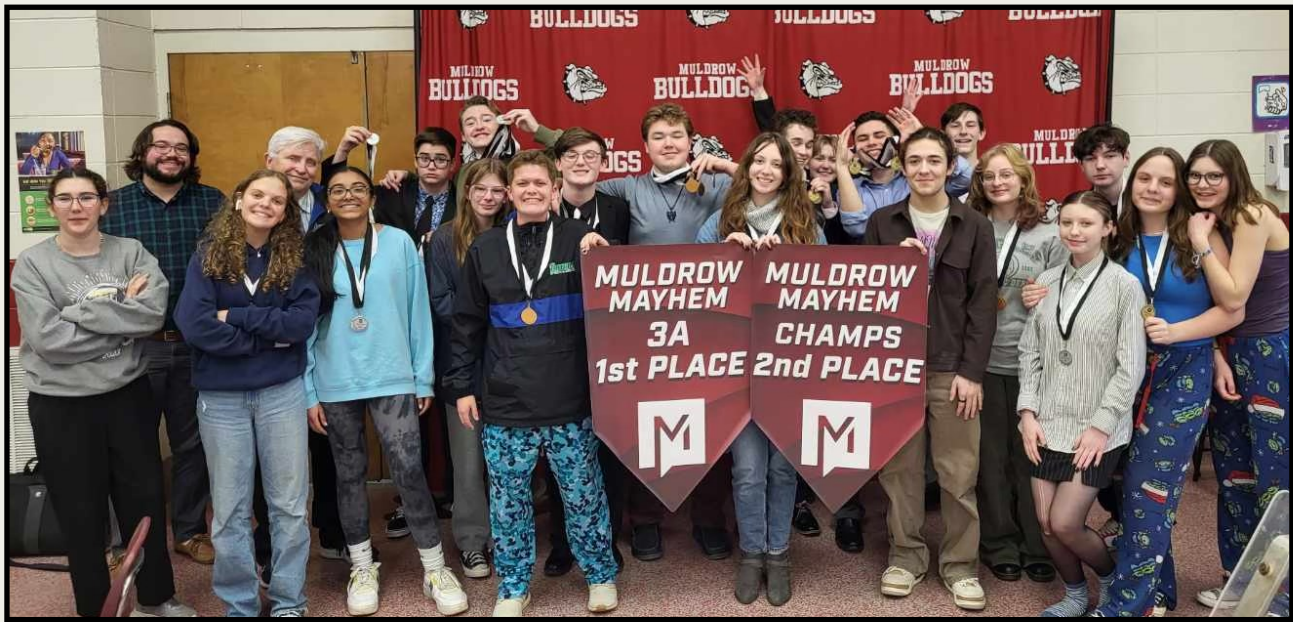
RCDS Speech and Debate teams are in the height of their seasons. They are pictured here after their February wins at Muldrow.