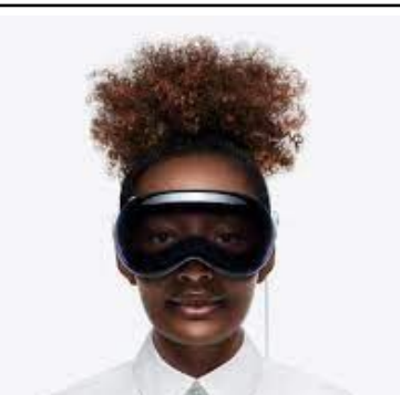
You get to look like you're skiing—for only $3500!

The Apple Vision Pro came out February 2nd this year and has already made a big impact so we will so where the road takes us whenever they find a way to manage to lower the insanely high price making it more accessible. The price for the VR is $3,500 which is way out of the price range for most people. My final thoughts on this is that it seems like a nice product but the price is way too high for what you are getting (It can't be that nice, right?) and I support the product but it becoming available to almost everyone seems intimidating just thinking about it like an everyday utility.