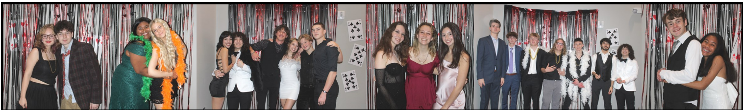
THE PHOTO BOOTH WAS POPULAR AT THE WINTER DANCE ON FEB 3...

Published monthly by and for the Upper School students of Riverfield Country Day School in Tulsa, OK Friday, February 23, 2024