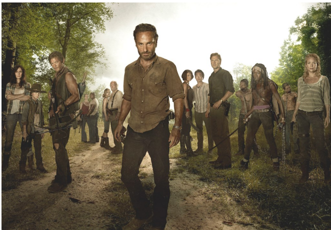
"The Walking Dead" ran from 2010-2022.