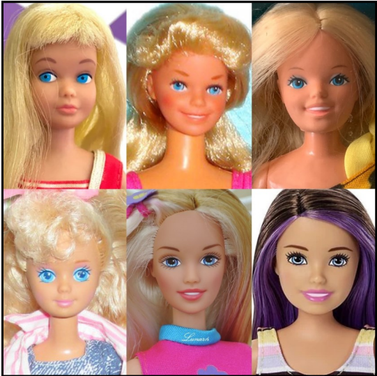
Skipper over the years. Top (from L to R): 1964 Skipper, 1979 Super Teen Skipper, 1985 Tropical Skipper. Bottom (from L to R): 1988 Teen Time Skipper, 1996 Teen Skipper, Skipper now (2024) PHOTO ILLUSTRATION BY SOPHIE PHILLIPS