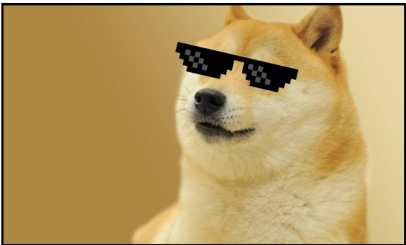
What is your favorite meme? Doge will never die.

were to be responsible for that explicit meme were to have people stop carrying them and the work that they do. A popular place where memes lie, is the app Facebook, usually used most by the Millennials. Nowadays, memes on the app, TikTok, can be expressed throughout a video with text. It's the same, but it's a video, rather than a picture. I think the memes that are too blunt can be cut off by the groups on Facebook, that are either kid friendly or R-rated. As for TikTok, It's your choice to know what content you want to look at, but you are warned. Therefore, if these guidelines were to be followed by everyone, I think memes could make the world a much better place. Doge approves!